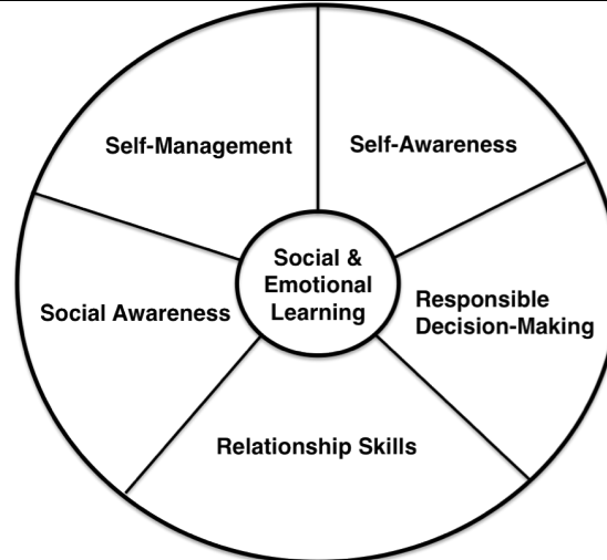
Figure 1. CASEL SEL Competencies